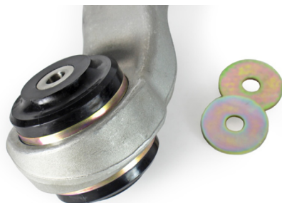
Figure 1 - Fitted Image