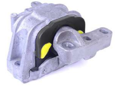
Figure 4 - showing all polyurethane inserts fitted inside the upper engine mount