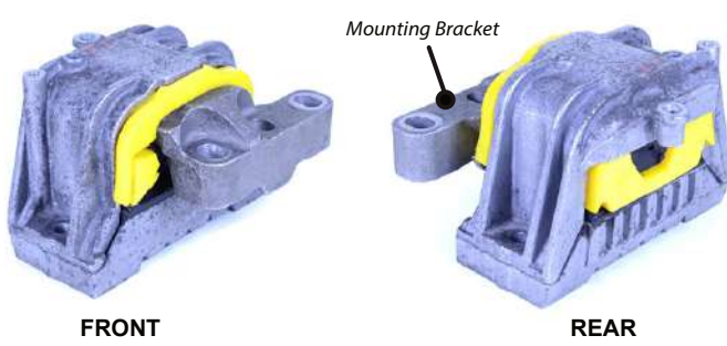
Figure 2 - showing how part A and part B lock into each other in the engine mount

FRONT BACK Figure 3 - profile of the Upper engine mount that uses this insert.